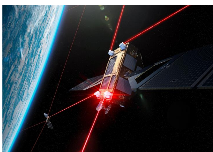
Project UN:IO aims to provide Europe with an independent satellite network.